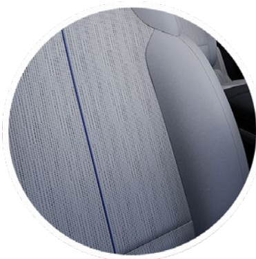
SKY COOL GRAY

Perforated Inteluxe seating with backlit Dark Ash Cluster open-pore wood trim